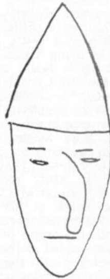
The face of the creature

Now, a few more details. Here are drawings of the face of the creature which Heinonen and Viljo say they saw, and of the black "box" from which emanated the pulsating light which the creature is stated to have aimed at Heinonen.